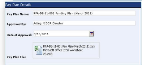
■ Pay Plan Detail Form

LCG has proven expertise in the development of budget and grants analysis applications.