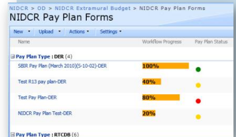
■ Pay Plan Status Indicators